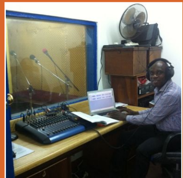
Moses Recording at studio