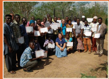
Buipe Kairos Training