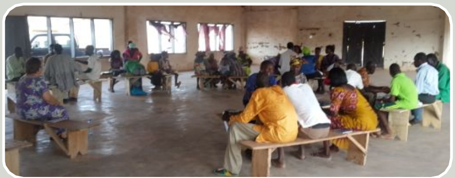
Training Rural Trainers with the Mamprusi people